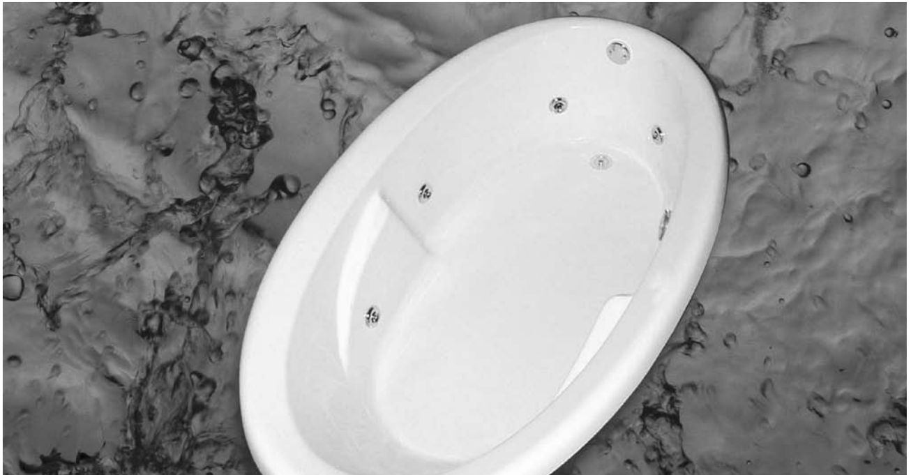
Model 6028E Shown in White with EverBrass (PVD) trim