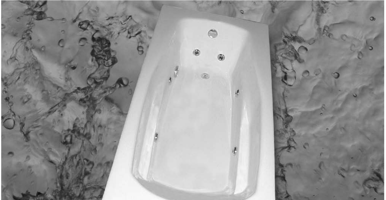
Model 6021 Shown in White with EverBrass (PVD) trim