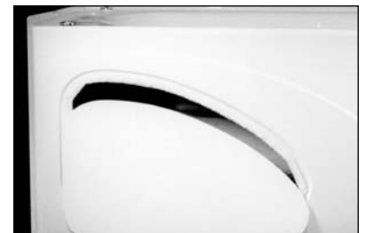
Optional Removable Access Panel