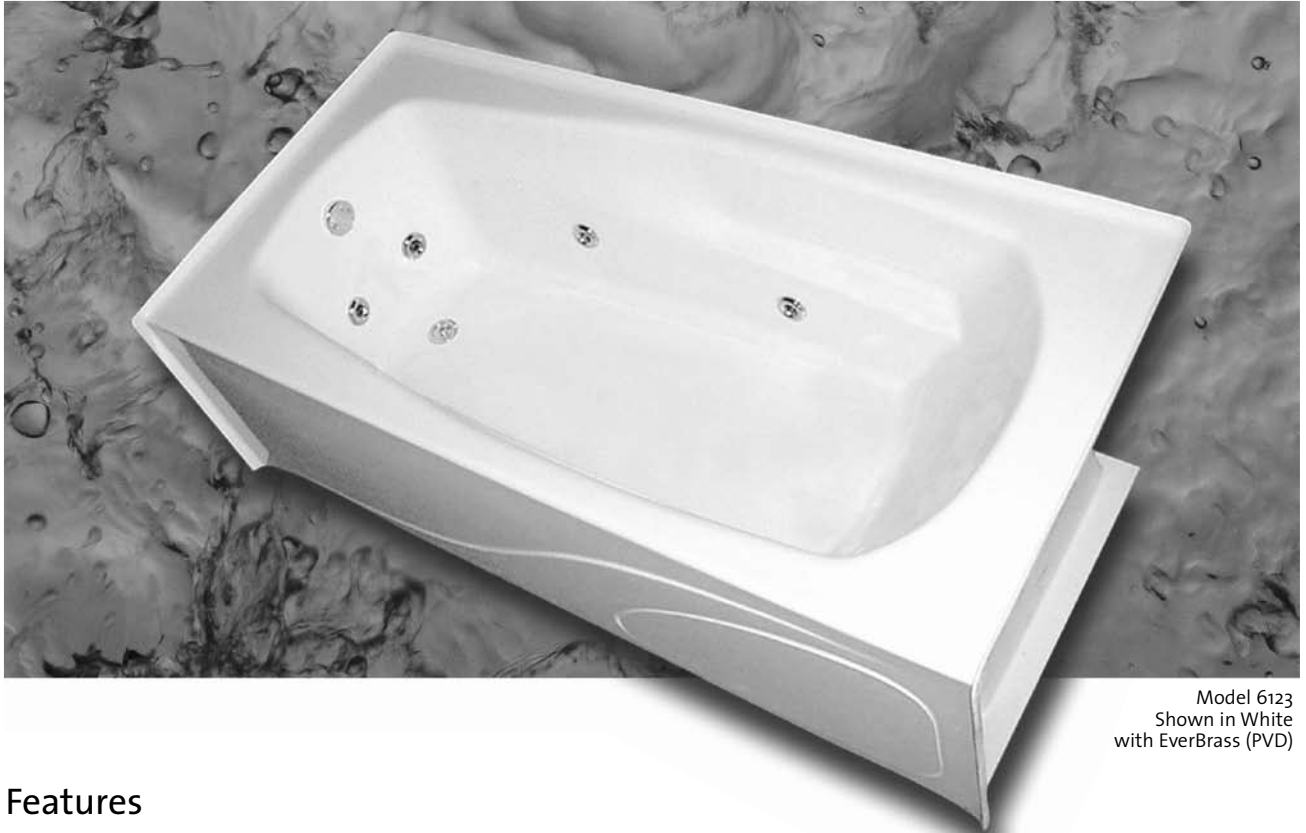
Model 6123 Shown in White with EverBrass (PVD)